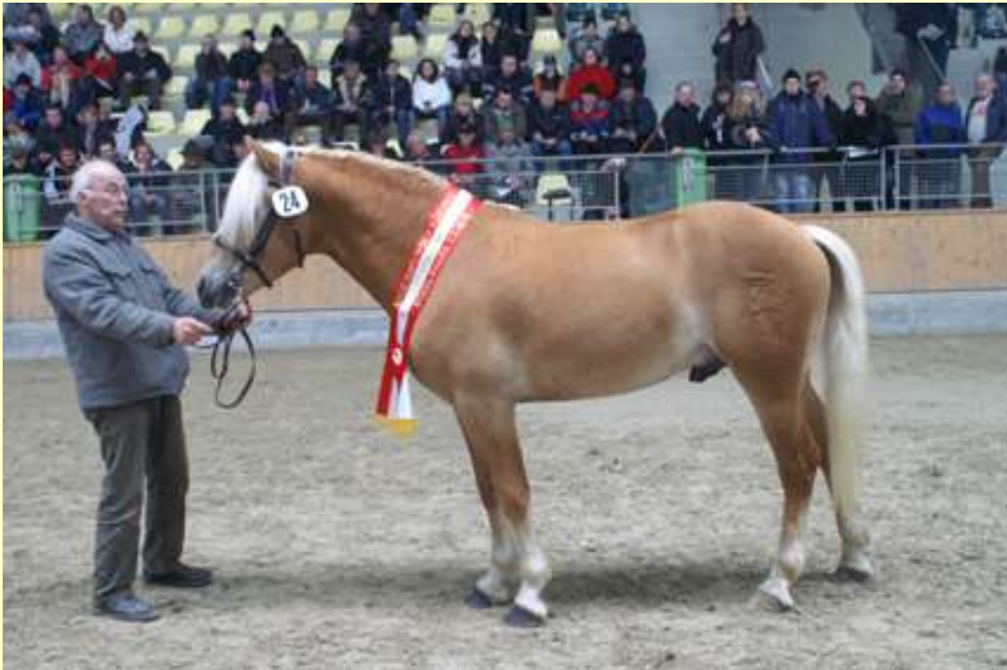
Anero by Aaron-B out of Mira