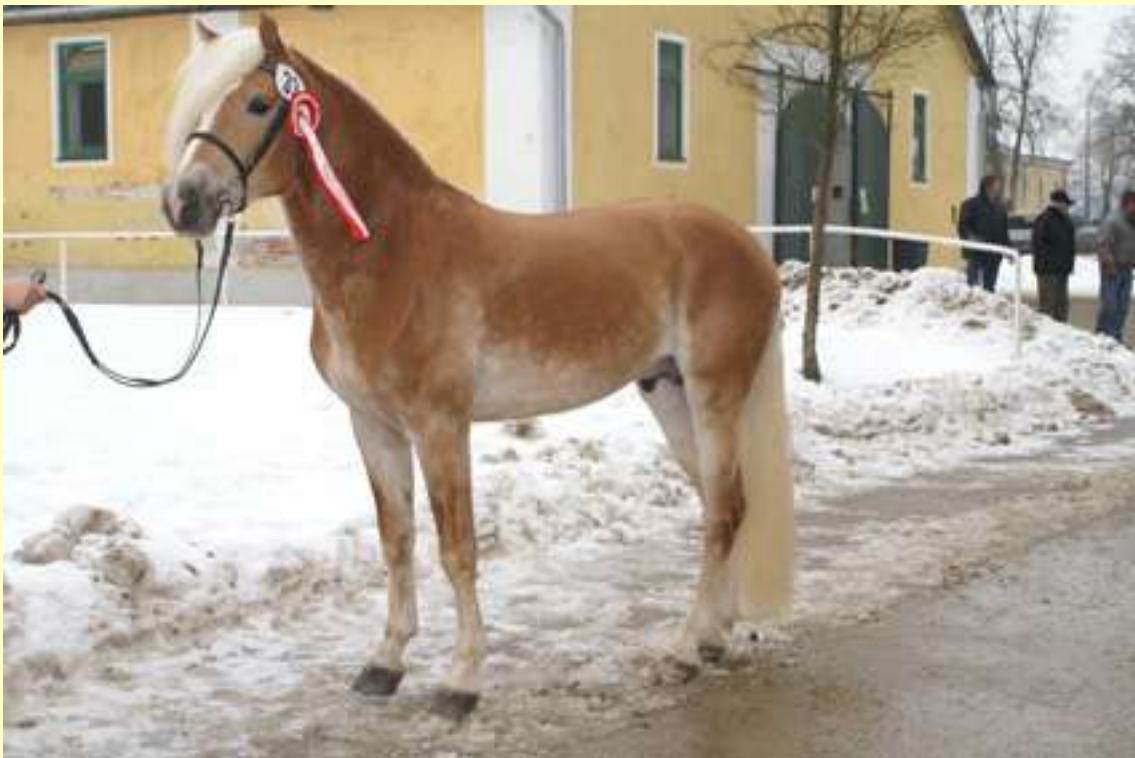
Niklas by liz. Notting Hill out of Alpina

The day started at 8.00 in the morning, with the measuring and veterinary check. At 9.30 the stallions had to pass the first selection hurdle as they were presented on hard ground. A deficit in the field of “correctness of gait” which is made obvious when the stallion is presented on hard ground can easily lead to a non-approval of a stallion that is in many other ways very attractive as a stud stallion. And even if a stallion passes this stage in the inspection process, and is shown in the arena for closer inspection, this single note often leads to an “Out”. After the happy gamins had been presented in hand at the triangle, they were let loose in the arena, to show off their movement to the audience and for the judges to evaluate – a task that was not always easy, as the some of the young stallions bucked all the way through the arena. Some of the stallions did present themselves in a very showman-ish way though, showing off a floating trot and thereby passing on to the final. The following stallions were approved for breeding: